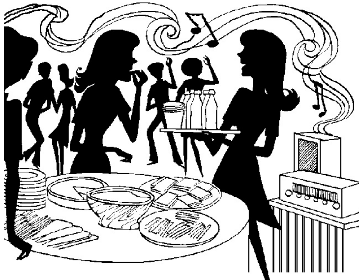
Figure 1: Organizing a party involves choosing music, food, drinks, catering, etc.

Imagine you are having a party. You have just graduated and plan to throw a nice party for that occasion. The problem is that you do not want to organize everything yourself. Fortunately, a friend of yours has also graduated and wants to throw a party as well. You decide to share the load.